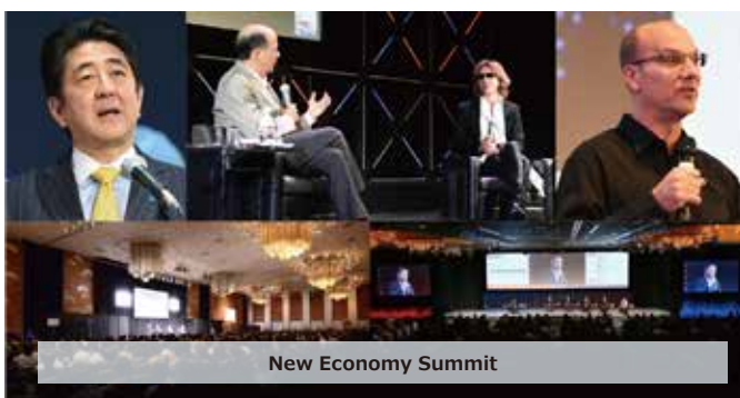
New Economy Summit