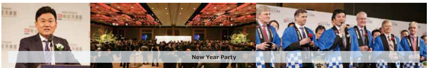
New Year Party

*Titles and positions are as of the date of the events