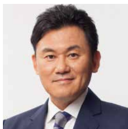
Representative Director Hiroshi Mikitani Chairman & CEO Rakuten Inc.